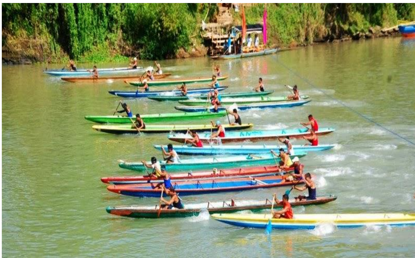
MARCH, FIRST OR SECOND WEEK – BANGKERO FESTIVAL PAGSANJAN, LAGUNA