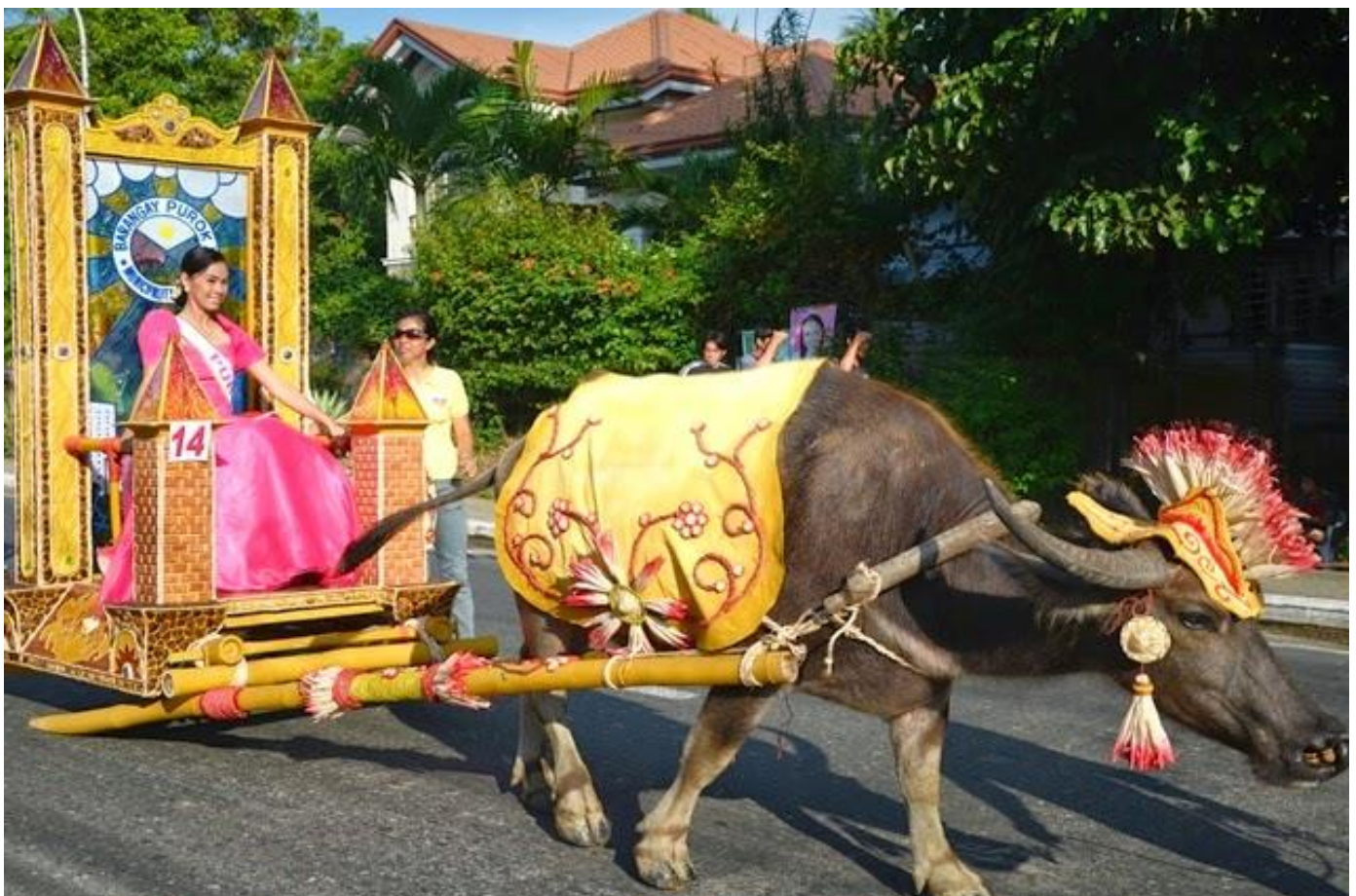
MAY 3 & 4 – CARABAO CARROZA ILOILO