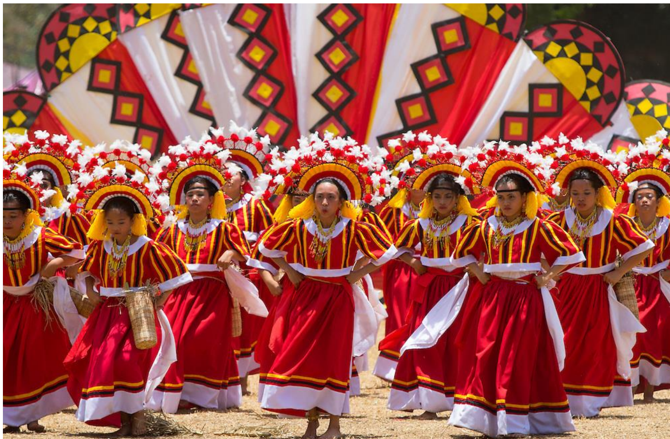
MARCH, FIRST WEEK – KAAMULAN FESTIVAL MALAYBALAY CITY, BUKIDNON