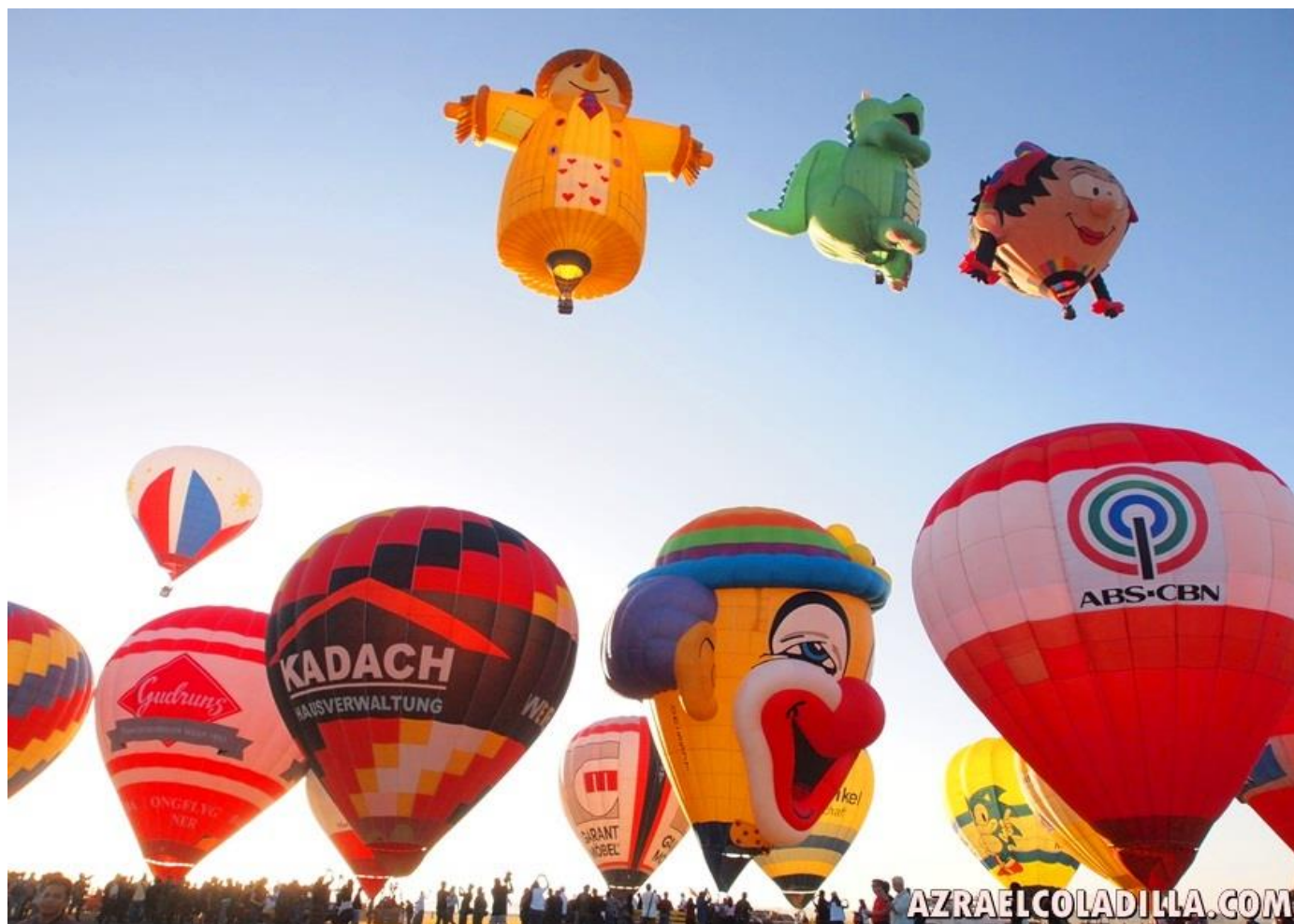
FEBRUARY – PHILIPPINE HOT AIR BALLOON FIESTA CLARK, PAMPANGA