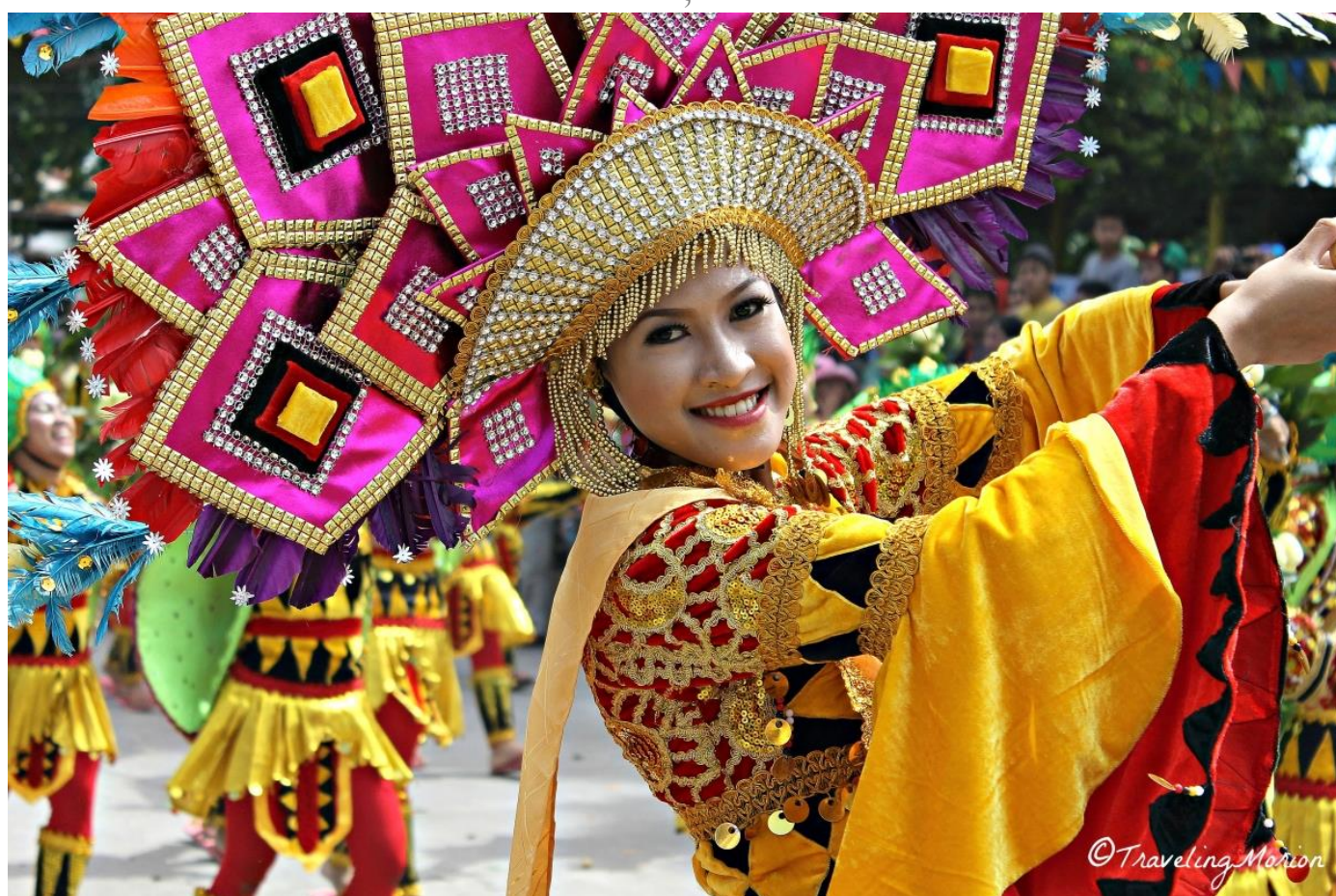
OCTOBER, THIRD WEEK – LANZONES FESTIVAL LAMBAJAO, CAMIGUIN