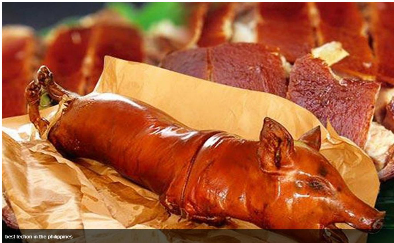
best lechon in the philippines

JUNE 24 – LECHON FESTIVAL BALAYAN, BATANGAS