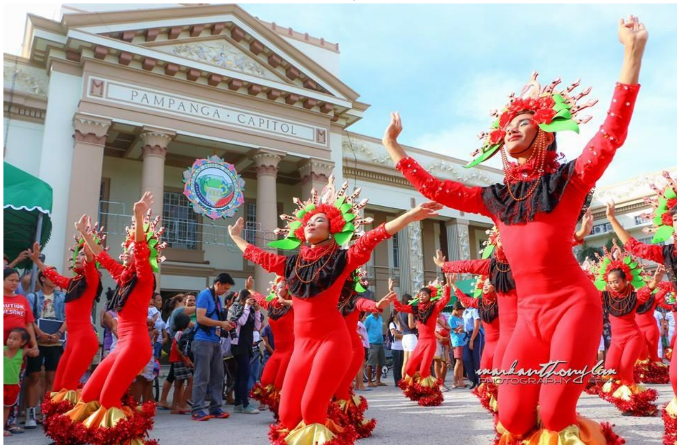
DECEMBER – SINUKWAN FESTIVAL SAN FERNANDO, PAMPANGA