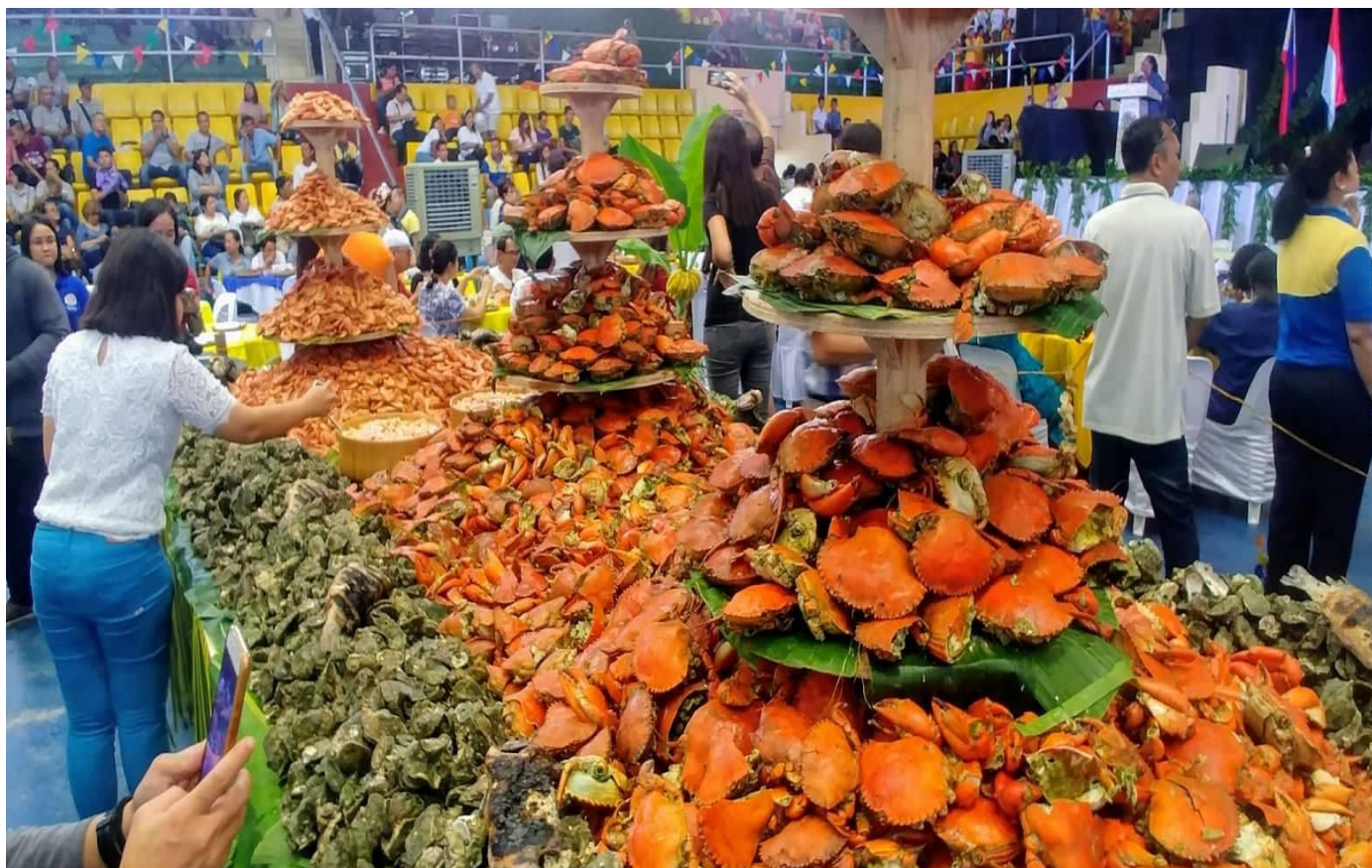
APRIL 20-23 – CAPIZTAHAN SEAFOOD FESTIVAL ROXAS CITY, CAPIZ