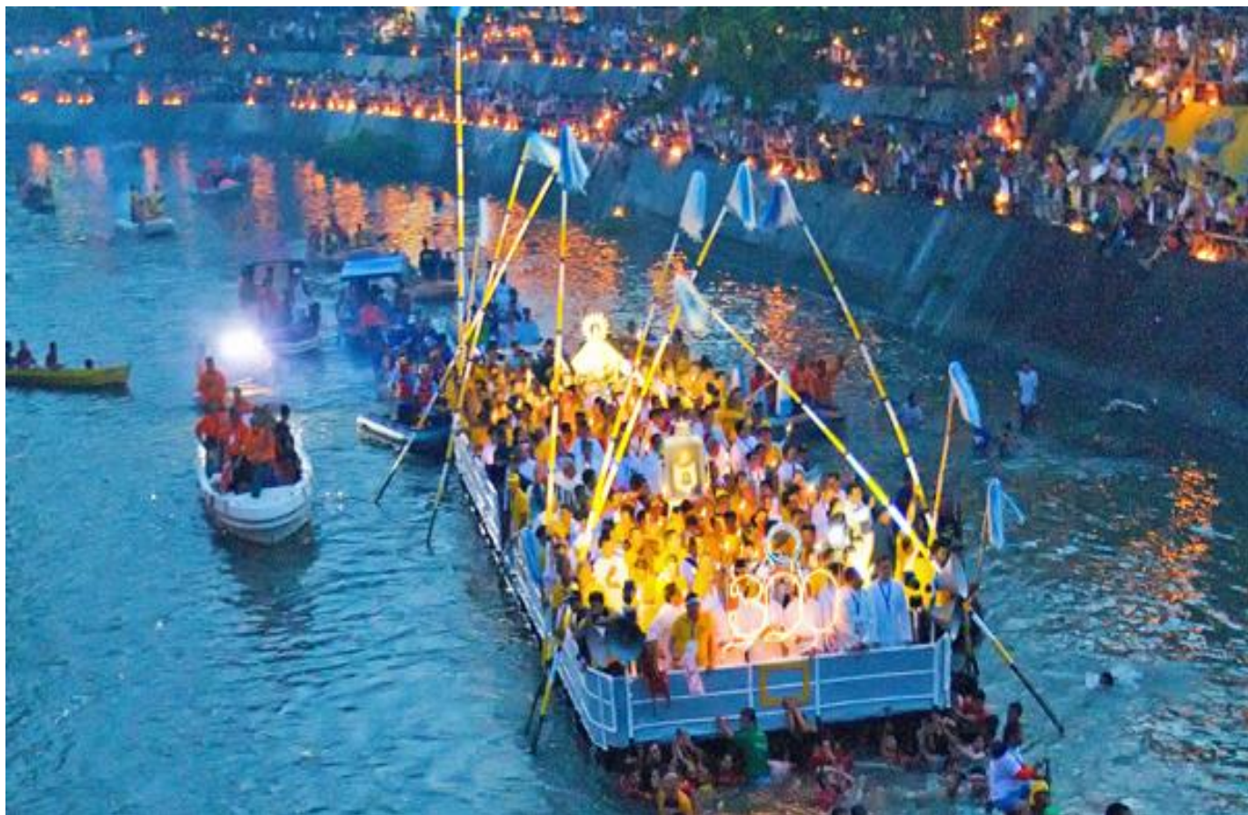
SEPTEMBER, THIRD SATURDAY – PEÑAFRANCIA FLUVIAL FESTIVAL NAGA, CAMARINES SUR