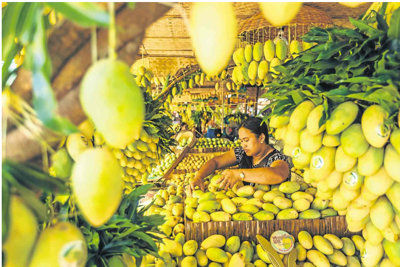
APRIL, 2ND-3RD WEEK – GUIMARAS MANGGAHAN FESTIVAL GUIMARAS, ILOILO