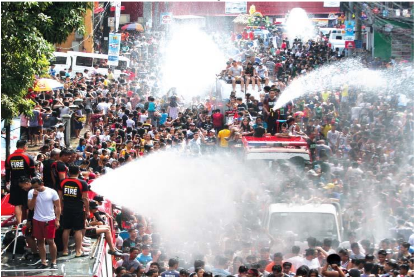
JUNE 24 – WATTAH WATTAH / BASAAN FESTIVAL SAN JUAN, METRO MANILA