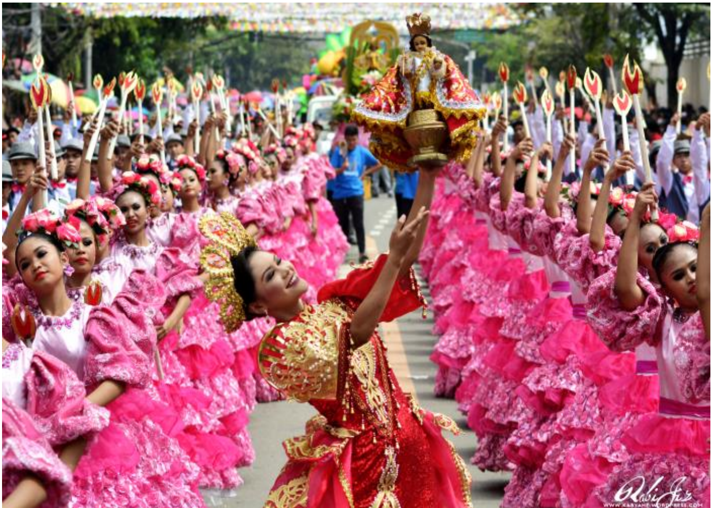
JANUARY, THIRD SUNDAY – SINULOG FESTIVAL CEBU