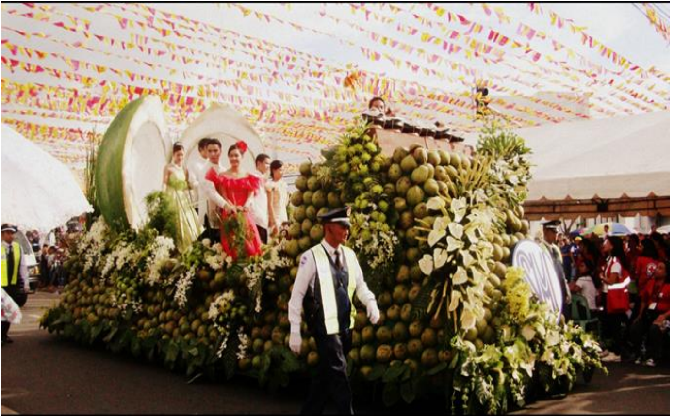
JANUARY 15 – COCONUT FESTIVAL SAN PABLO CITY