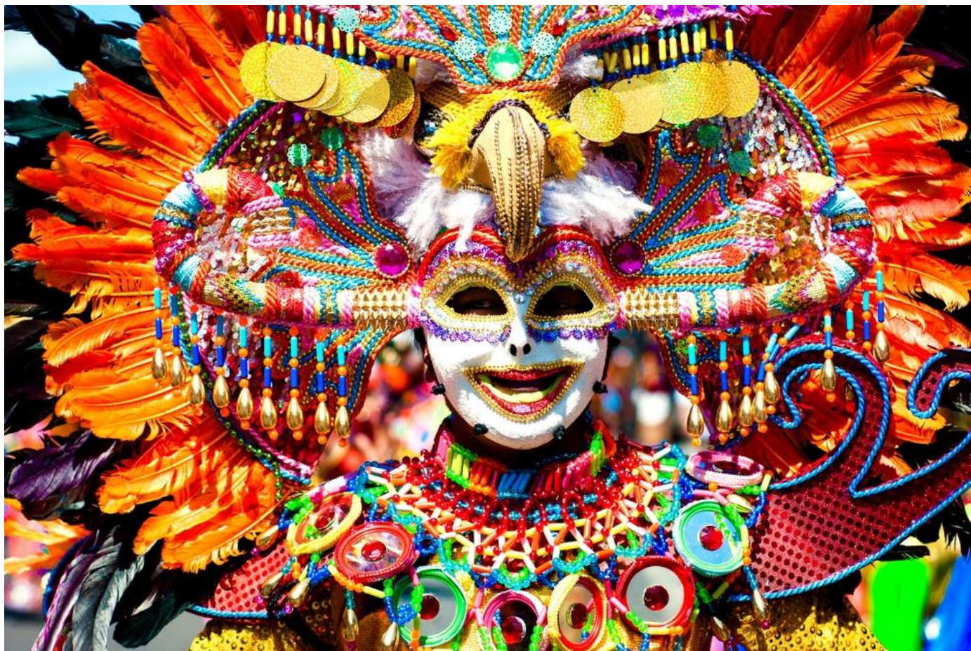
OCTOBER, THIRD WEEK – MASSKARA FESTIVAL BACOLOD, NEGROS OCCIDENTAL