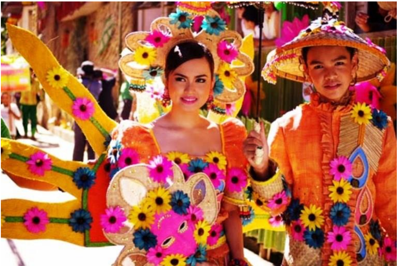
MAY – FLORES DE MAYO ALL OVER THE PHILIPPINES