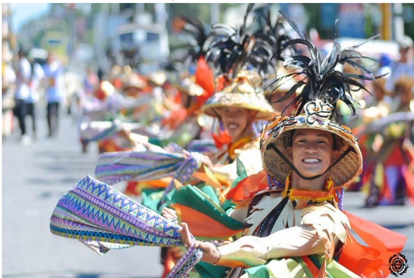
OCTOBER 19 – KANSILAY FESTIVAL SILAY, NEGROS OCCIDENTAL