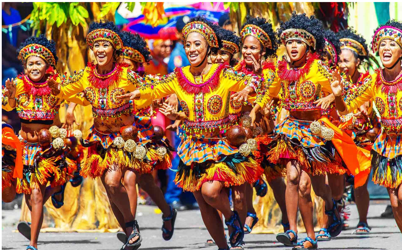
JANUARY, FOURTH WEEK – DINAGYANG FESTIVAL ILOILO