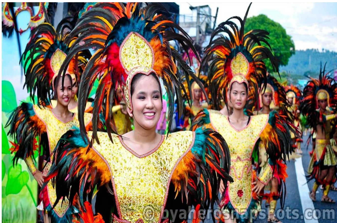
OCTOBER, THIRD WEEK – IBALONG FESTIVAL LEGAZPI, ALBAY