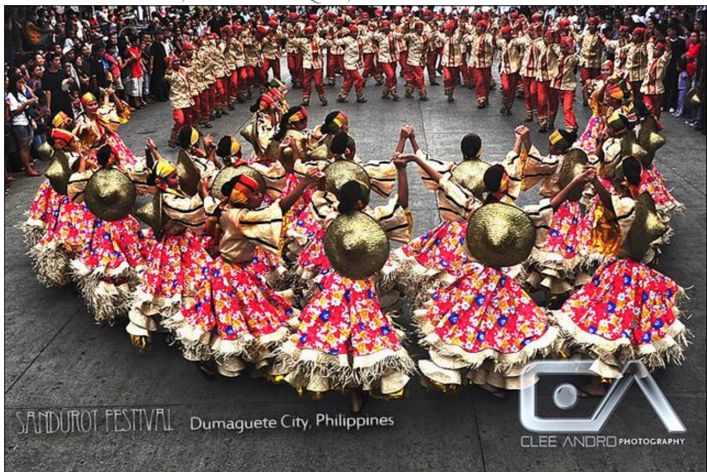
NOVEMBER 9-15 – SANDUROT FESTIVAL DUMAGUETE CITY, NEGROS ORIENTAL