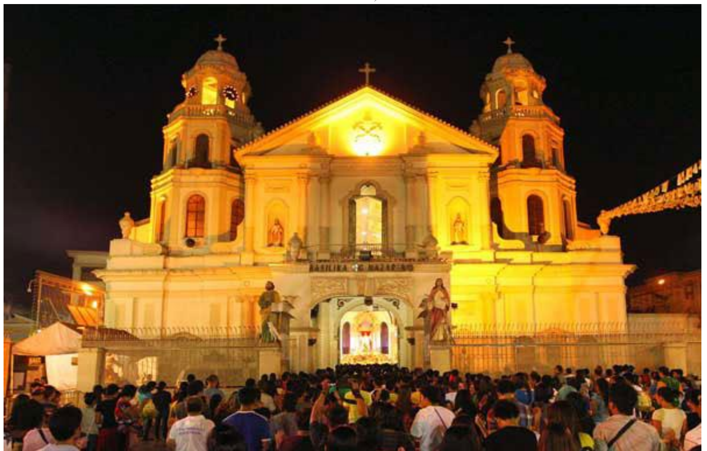
DECEMBER – SIMBANG GABI CHRISTMAS SEASON ALL OVER THE PHILIPPINES