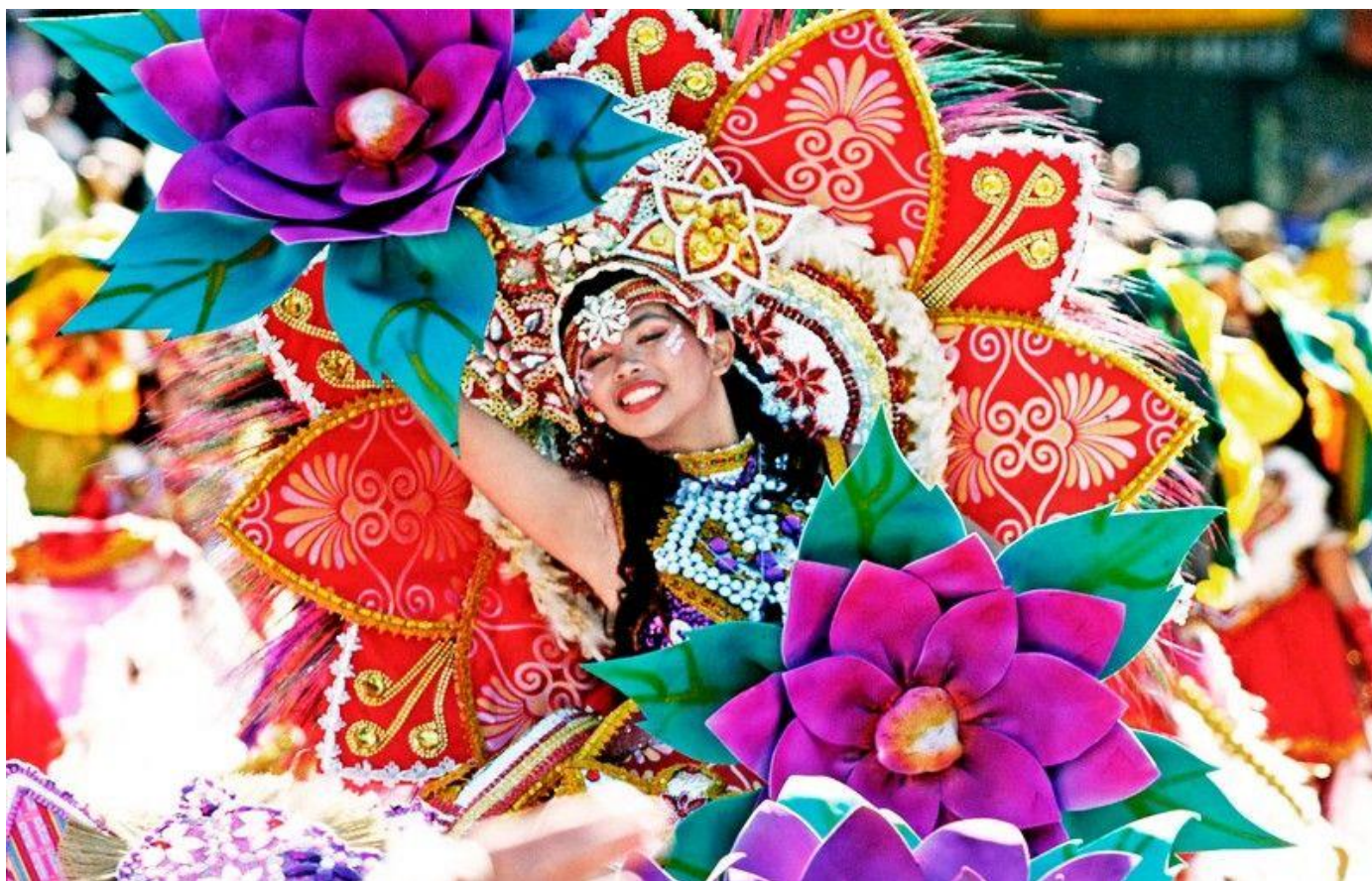
FEBRUARY, THIRD WEEK – PANAGBENGA FLOWER FESTIVAL BAGUIO CITY