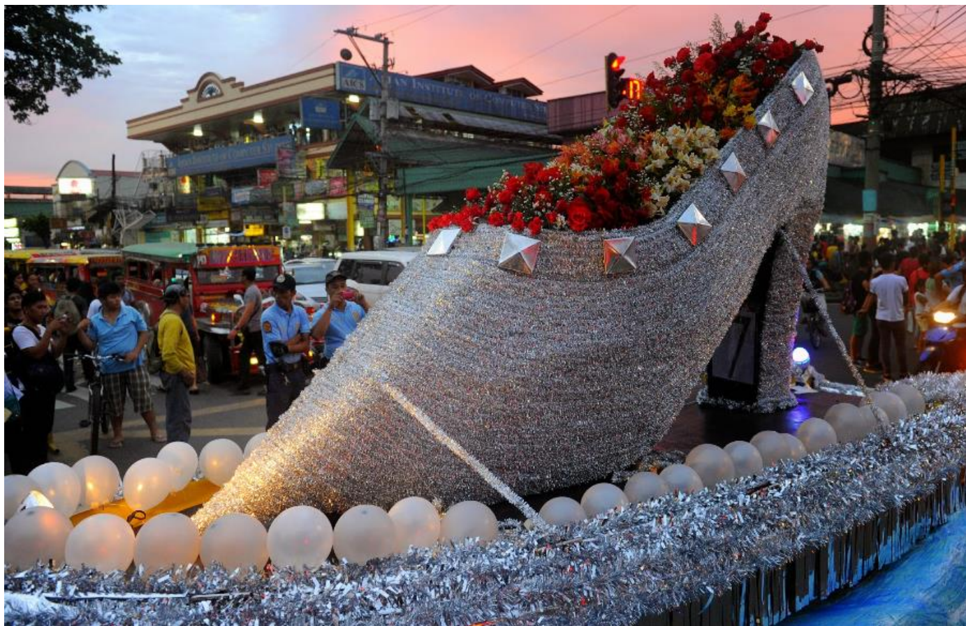
SEPTEMBER - SAPATERO FESTIVAL MARIKINA, METRO MANILA