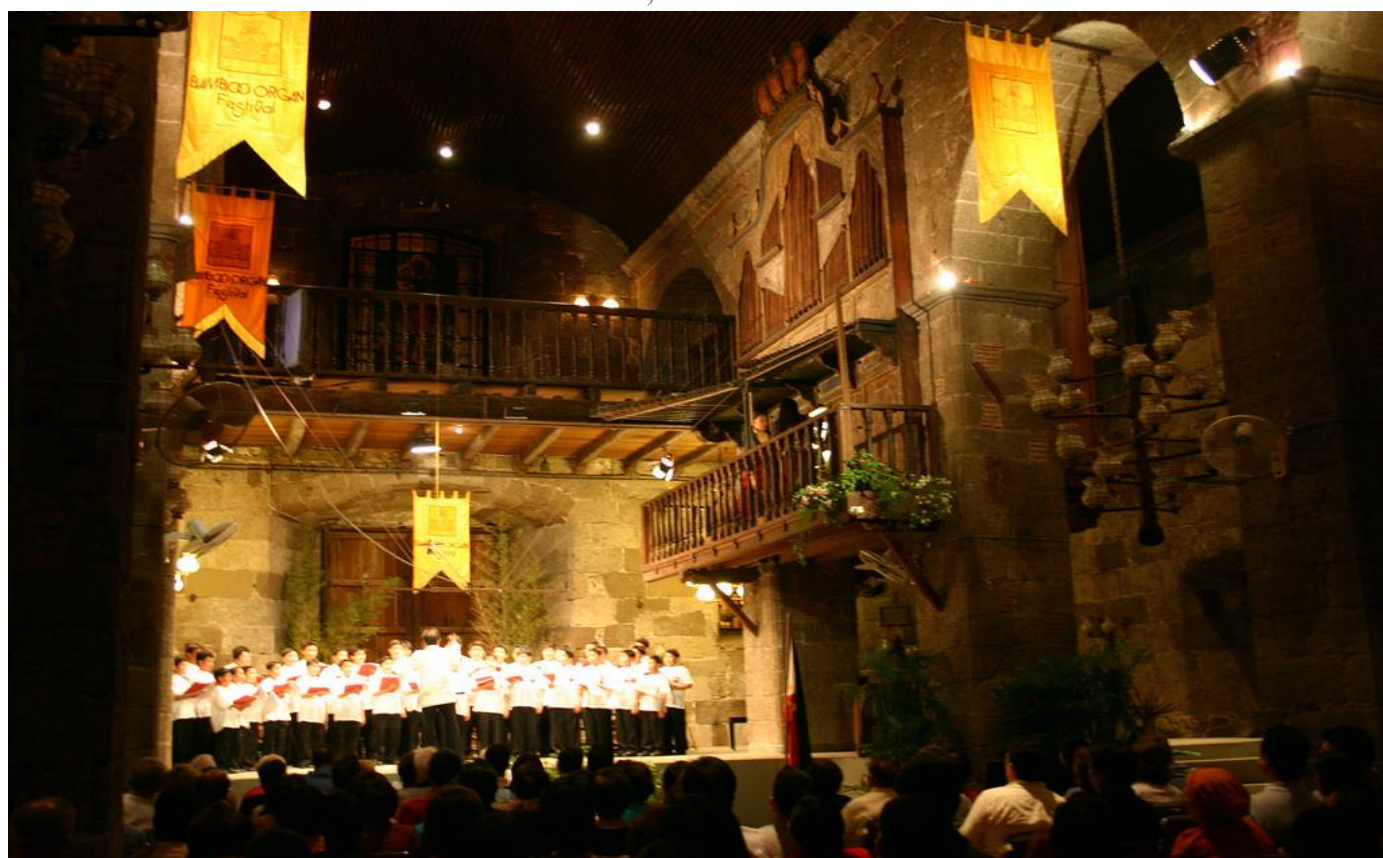
FEBRUARY 16 – BAMBOO ORGAN FESTIVAL LAS PIÑAS CITY