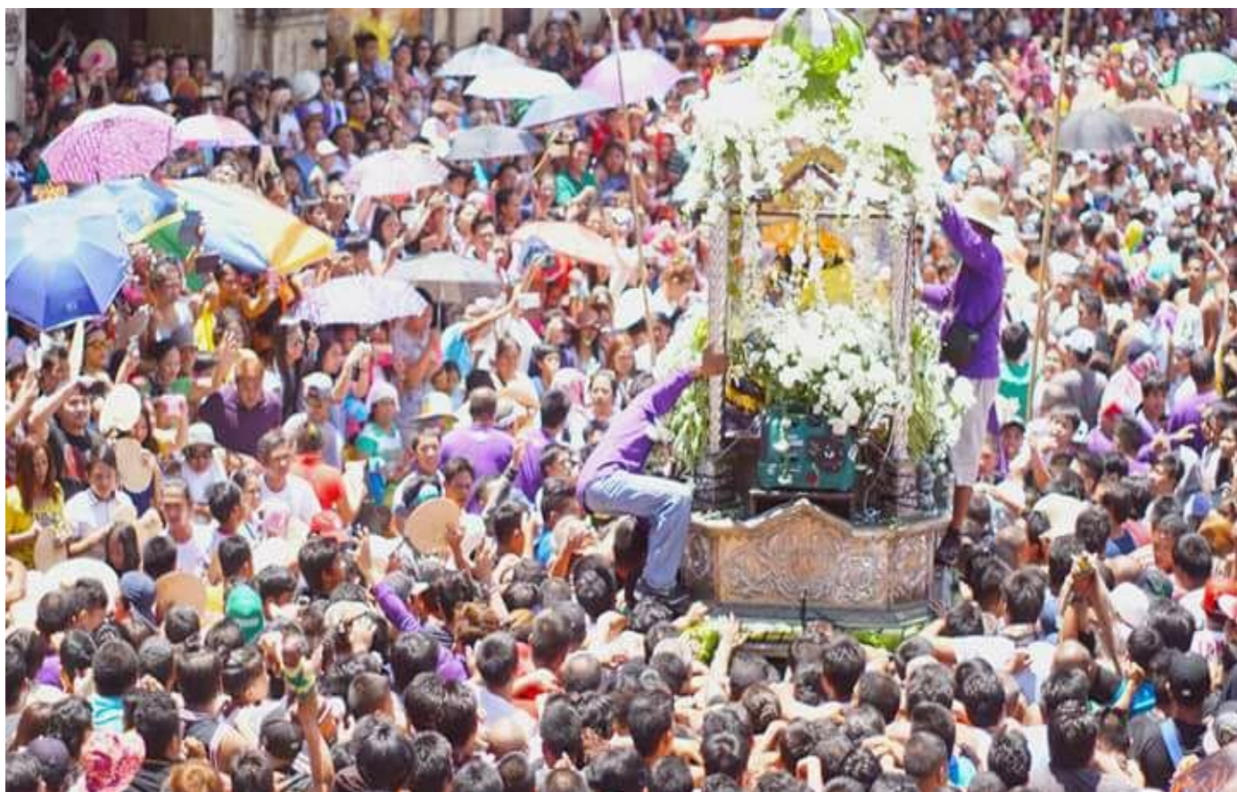
APRIL AND MAY – TURUMBA FESTIVAL PAKIL, LAGUNA