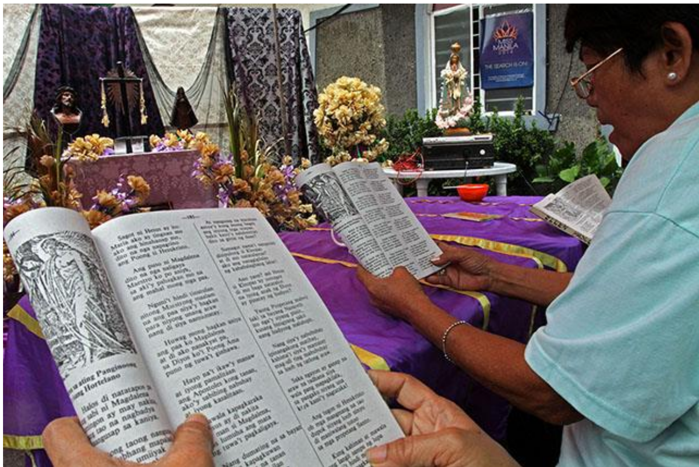
APRIL, HOLY WEEK – PABASA NG PASYON ALL OVER THE PHILIPPINES