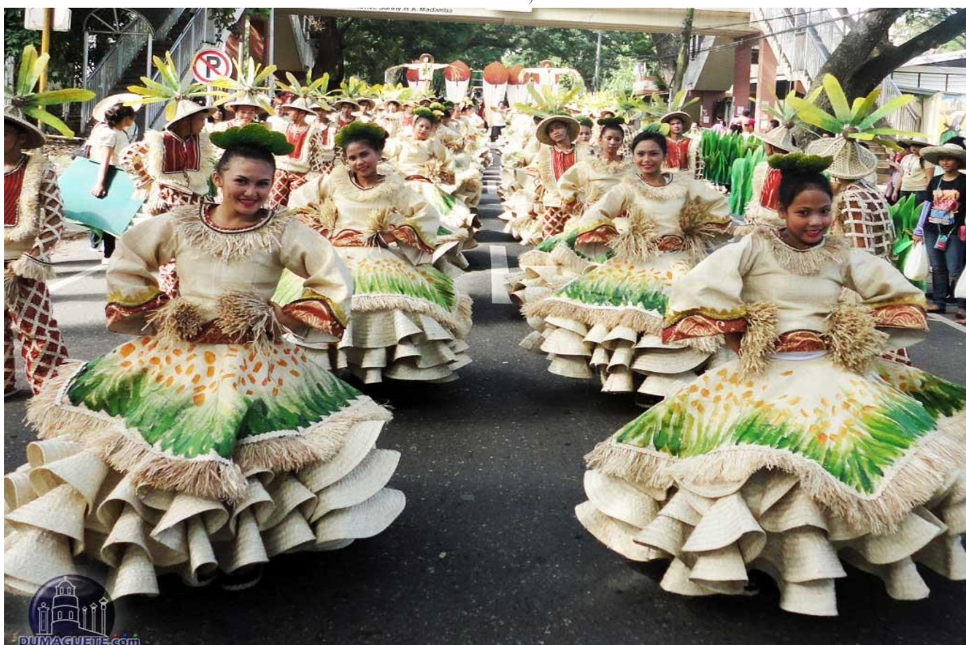
MARCH, THIRD WEEK – PASAYAW CANLAO CITY, NEGROS ORIENTAL