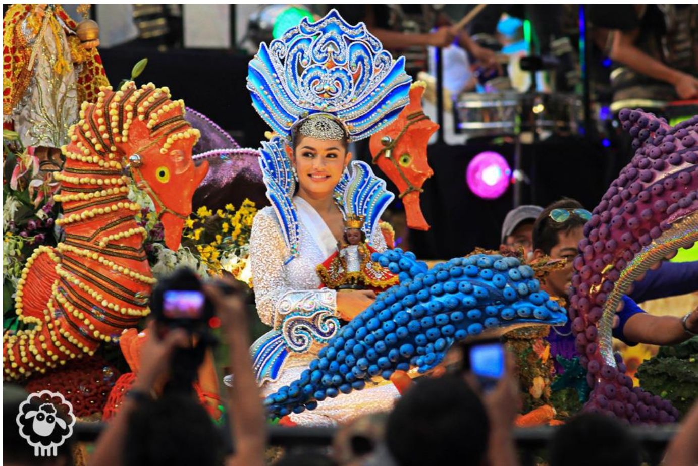
APRIL, LAST WEEKEND – ALIWAN FIESTA PASAY CITY, METRO MANILA