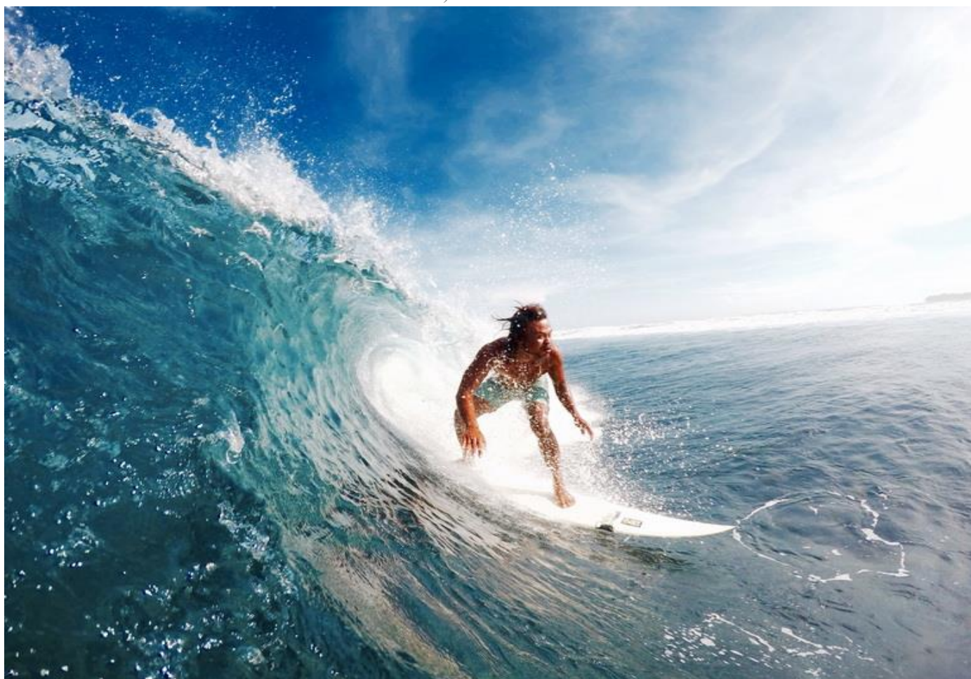
SEPTEMBER – SIARGAO SURFING FESTIVAL SIARGAO, SURIGAO DEL NORTE