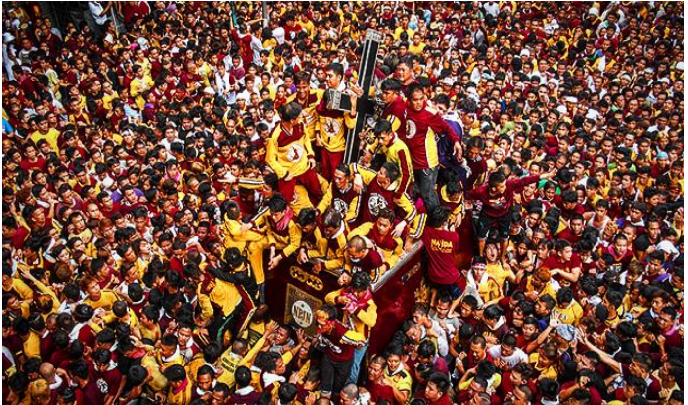
JANUARY 9 – TRASLACIÓN, FEAST OF THE BLACK NAZARENE QUIAPO, MANILA