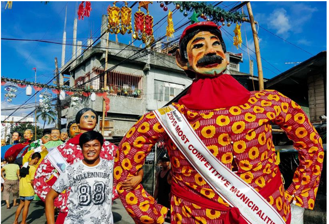
NOVEMBER - HIGANTES FESTIVAL ANGONO, RIZAL