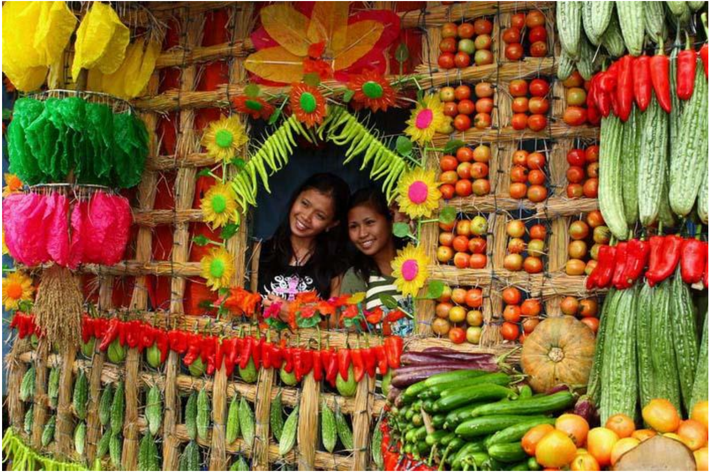
MAY 15 – PAHIYAS FESTIVAL LUCBAN, QUEZON