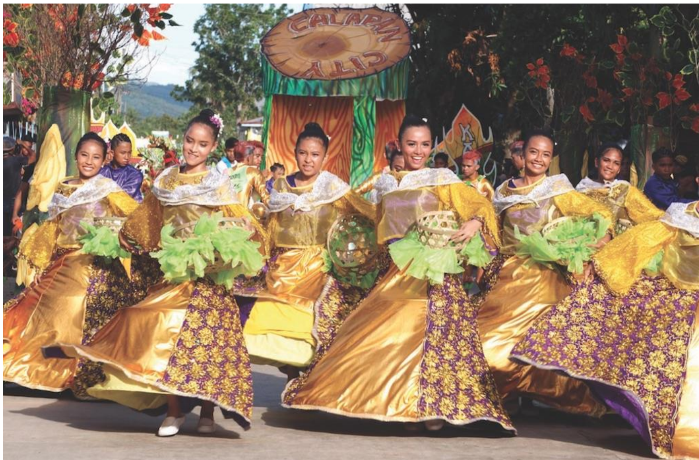
NOVEMBER – MIMAROPA FESTIVAL MINDORO, MARINDUQUE, ROMBLON AND PALAWAN