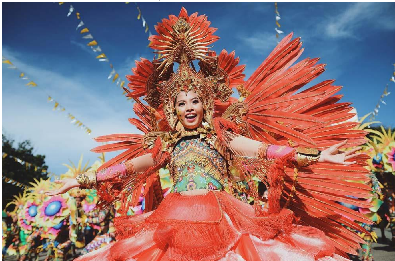
NOVEMBER 3-5 – PINTAFLORES FESTIVAL SAN CARLOS CITY, NEGROS OCCIDENTAL