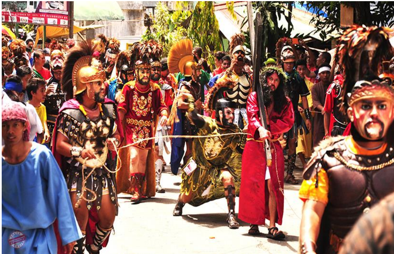
APRIL, HOLY WEEK – MORIONES FESTIVAL MARINDUQUE