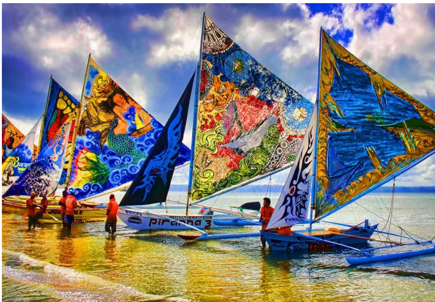
FEBRUARY 10-15 – PARAW REGATTA ILOILO