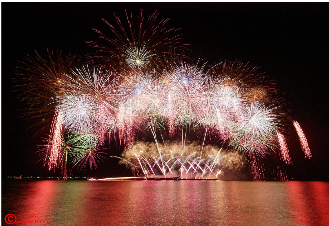
FEBRUARY 16-23 – PHILIPPINE INTERNATIONAL PYROMUSICAL COMPETITION