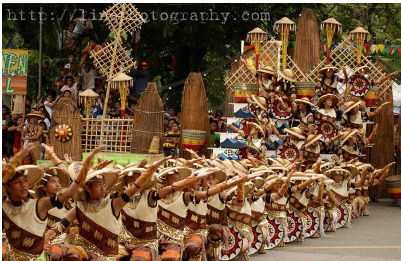
FEBRUARY – FIRST AND SECOND WEEK – PAMULINAWEN LAOAG CITY