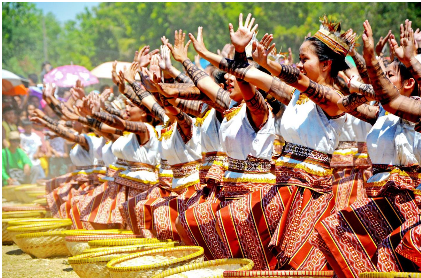
MARCH, FIRST AND SECOND WEEK – ARYA! ABRA BANGUED, ABRA