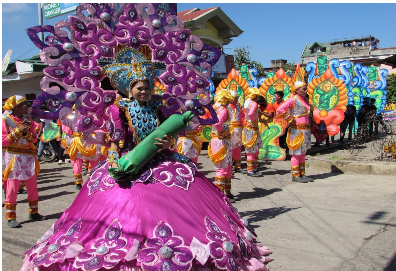
FEBRUARY, THIRD WEEK – SUMAN FESTIVAL BALER, AURORA